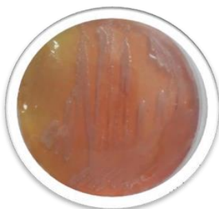
Fig. 2: Off-white colonies on Hay's flick agar.

Broth positive samples were inoculated then on Hay's flick agar. Off white color growth obtained on gar media was indicative of Mccp (Fig 2).