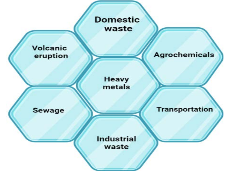
Figure 1. Common HM sources accumulate in water and soil.