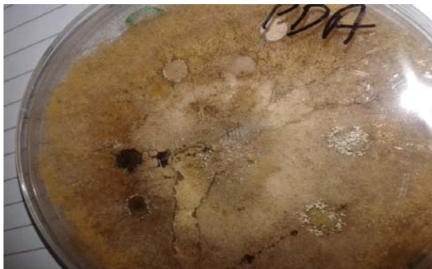
Figure 3: Plate showing activity of Stevia extract against Aspergillus flavus